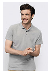
SOL'S SPRING II 11362